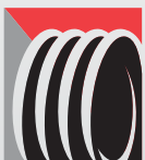
(Dimensions & Weights are approximates for most common size LS)