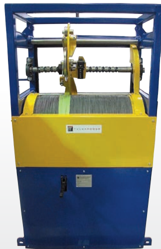
WLTU-20 A/C Vector

We can also customize equipment to fit your specific applications as needed.